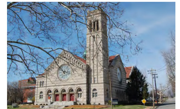
Union Avenue Christian Church

TOUR COST: $20.00 for members, $30.000 for non-members