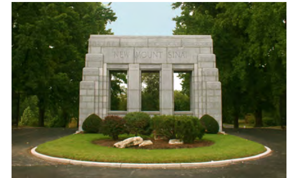
Entrance to Mt. Sinai Cemetery

RESERVATIONS REQUIRED FOR WALKING TOUR ONLY; the exhibit and symphony concert do not require reservations. These events are free. To make reservations for the walking tour, contact Daniel Brodsky 314-353-2540 or danielbrodsky@NMScemetery.org