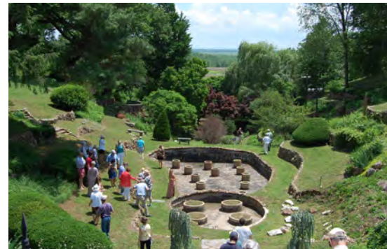
Kuhs Farm gardens