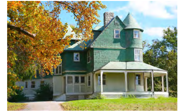
Eliestoun, Principia Campus

RESERVATIONS REQUIRED through Landmarks Association. Call 314-421-6474 or email stschetter@landmarks-stl.org to register.