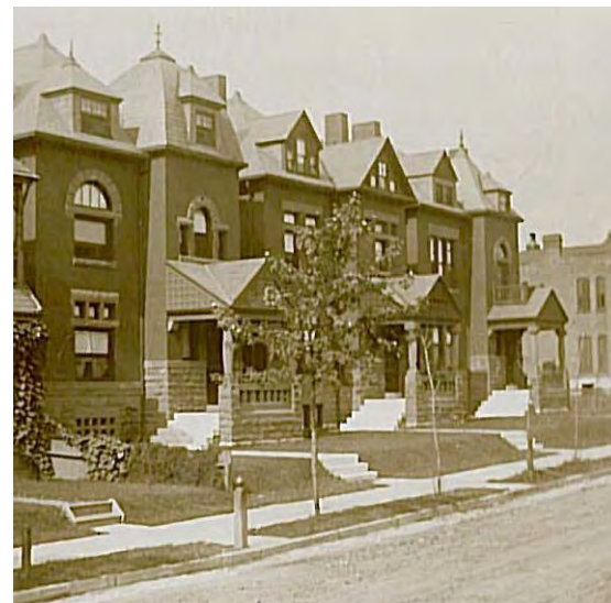
The block of 4244-52 West Bell circa 1890s.

By 1875, Bell Avenue (a portion of which would become West Belle Place) had been laid out between Vandeventer Avenue on the east and Taylor Avenue on the west, but the land (including lot 31) remained almost completely undeveloped. The 1875 Pictorial St. Louis Map depicts only two large homes along the entire length of Bell, neither of which survives