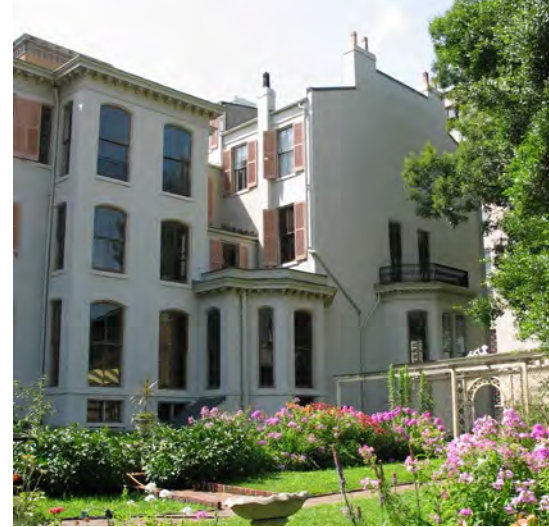
Campbell House Museum

Simply identify yourself as a member and enjoy a tour of this stunning Victorian home at 1508 Locust Street, St. Louis, 63103. For more information call 314-421-0325.